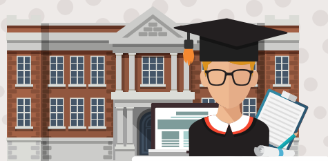
Students Self Service